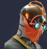
Nassim Eddequiouaq, a16z